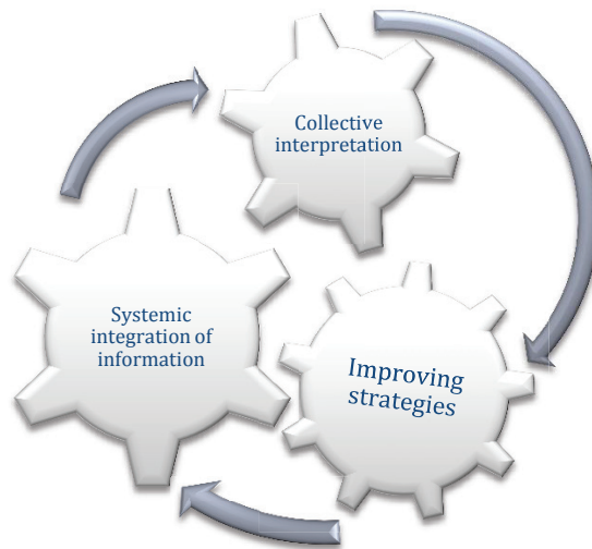
Figure 2 Strategic Learning Model

for the focus and choosing the right tools for learning about that element. This ensures that resources are not wasted in collecting information about something that may be interesting but is not useful in improving a strategy and its outcomes. This approach also emphasizes the use of a research base underlying the work. The research in this case drew from the public will-building framework developed by the Metropolitan Group (2009) and was reinforced by research on communications, mobilization, educating, and organizing.